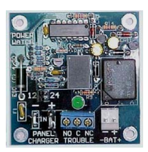
Fig: PW-1 Battery Supervision Module