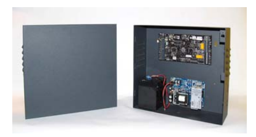
LP-3EB shown with AIM-1SL