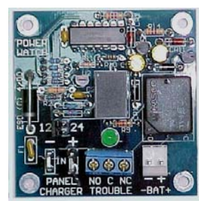
Fig: PW-1 Battery Supervision Module for LP-3